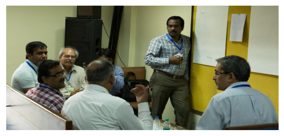
Members of Group-3: Discussion on Devices & Technology