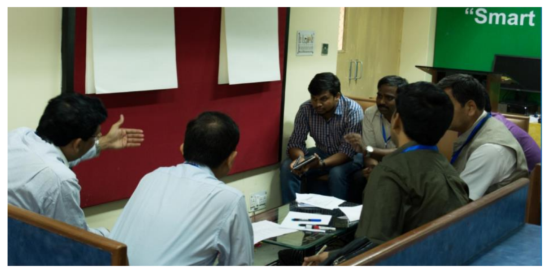
Members of Group-4: Discussion on Distributed Energy Resources, Storage and Deployment Issues